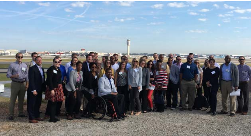
Center for Leadership Class of 2017

During the course of the nine-month program, participants will have an opportunity to provide leadership on a critical Atlanta regional issue through a mini Technical Assistance Panel (mTAP). Working in teams, participants will be responsible for sharing their expertise and advice to develop recommendations for a sponsor organization.